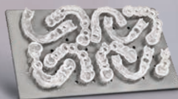
Surgical Guides up to 10 Surgical Guides