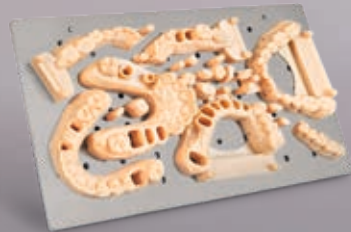
Crown & Bridge Models up to 6 Crown & Bridge Models

200+ validated resins available for 15+ dental applications