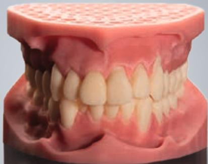
printed with rs VIVO Model Natural Pink and Ivory