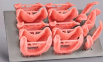
Denture Bases up to 13 Denture Bases