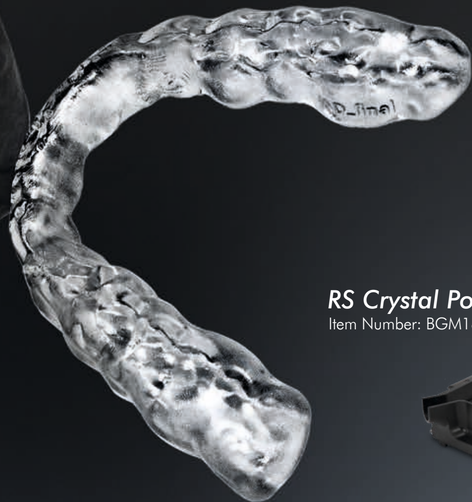
RS Crystal Polish Reservoir Item Number: BGM183401